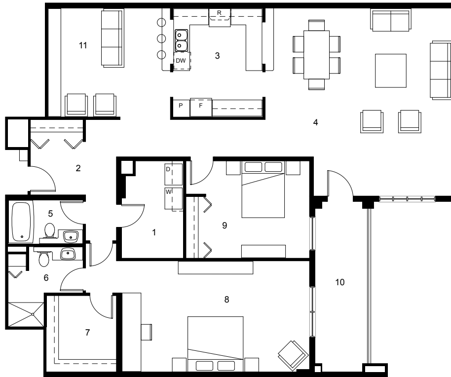
2nd & 3rd FLOORS